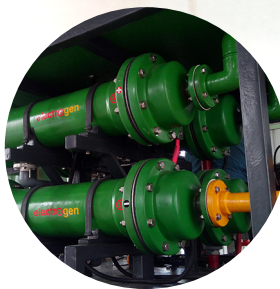
electrogen Electro-Oxidation Cell