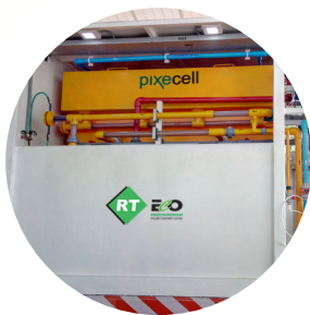
pixecell Electrocoagulation Cell

RT ECO Grease Trap Wastewater Treatment System is designed to achieve a high efficiency in separating fat, oil and grease, meeting permissible environmental discharge standards or it could be ideally used for achieving 'Zero Liquid Discharge' regulations. The treated water could be reused by the establishment suitably.