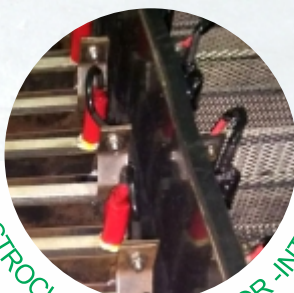
ELECTROCHEMICAL REACTOR -INTERIOR