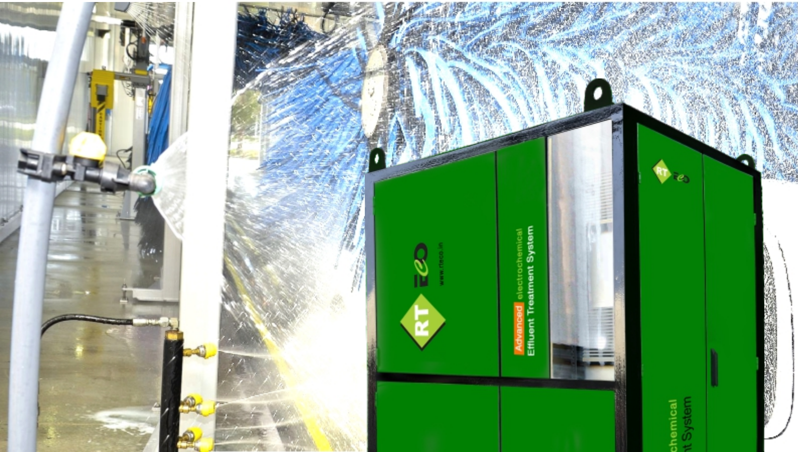
RT ECO System

RT ECO Car/Truck Wash wastewater Treatment system is designed to treat and remove pollutants such as Dirt, Oil & grease , Surfactants and to reduce Chemical Oxygen Demand (COD) and reclaim water for reuse.